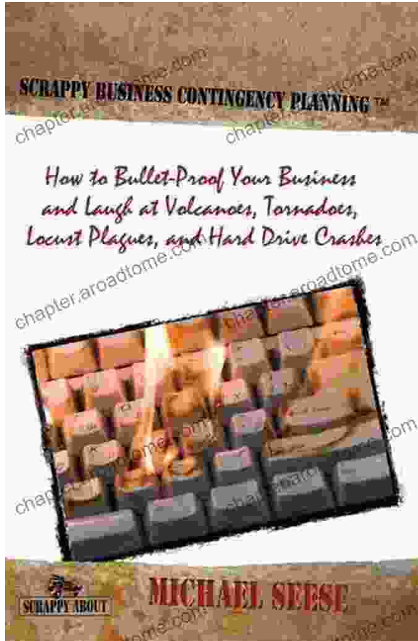
Scrappy Business Continuity Planning: How to Bullet-Proof Your Business and Laugh at Volcanoes,