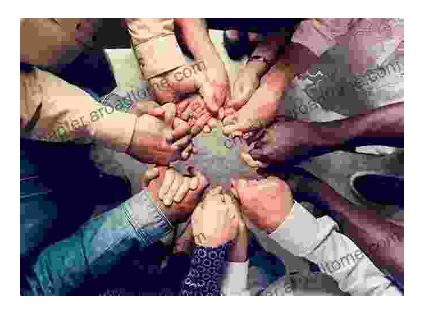
Breaking the Cycle: The Importance of Intervention and Prevention

Addiction is not a hopeless battle. 'An Exploration Of The Road To Ruin' underscores the critical role that intervention and prevention play in combating this devastating epidemic.